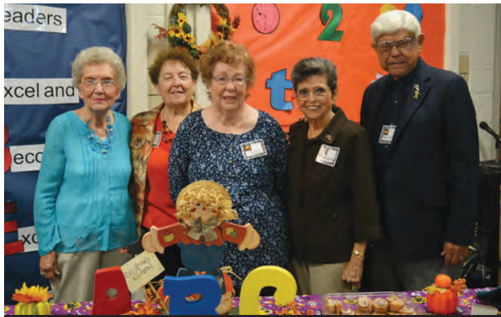
Members of the Corpus Christi Area Retired Teachers Association volunteer at a local school

Through the money earned from yearbook advertising, JSCRSEA