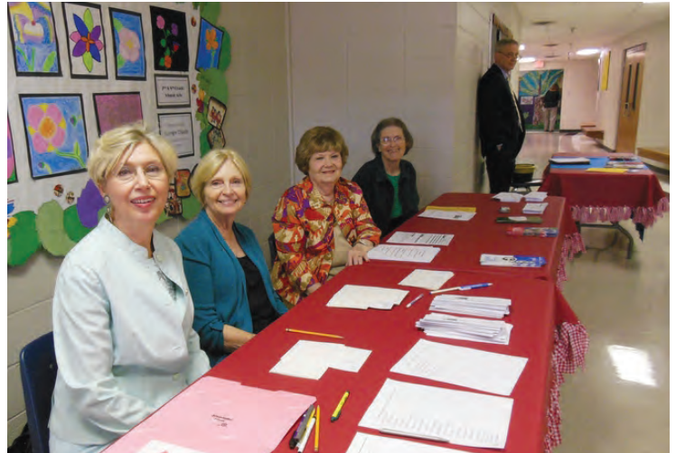
San Marcos Association of Retired Teachers welcomes members and friends to their event