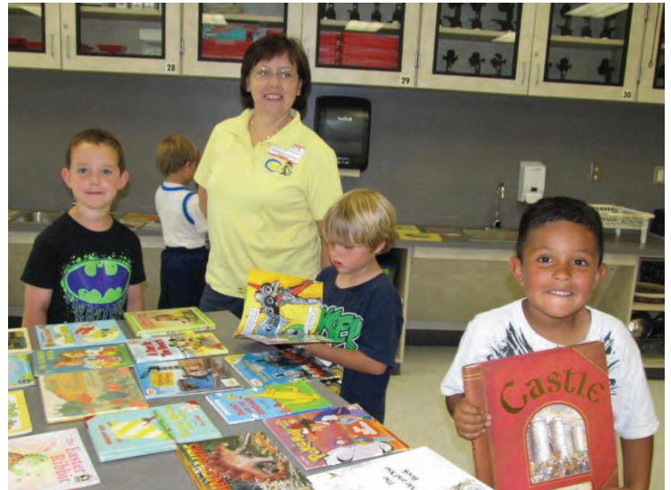
Brazoria County Retired Teachers Association delivers books for the Children's Book Project

Johnson-Somervell Counties Retired School Employees Association (JSCRSEA) , located in TRTA District 11, began its 2016 fall season with a bang by treating its membership, area superintendents and yearbook advertisers to a barbecue lunch.