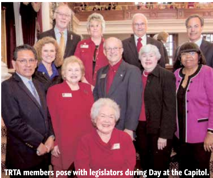
TRTA members pose with legislators during Day at the Capitol.

With many changes and lingering frustration from the 2011 session, our members were ready to be vocal with candidates for political office. Nothing was more important to them than simply keeping what they have and electing Senators and Representatives that would find a way to protect their benefits.