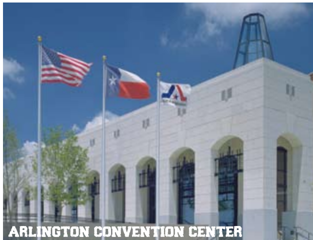
ARLINGTON CONVENTION CENTER

2401 East Lamar Boulevard • Arlington, TX 76006 King 1-2 people $125 • Double 2-4 people $135 Room block is open until March 25, 2010. 800.445.8667