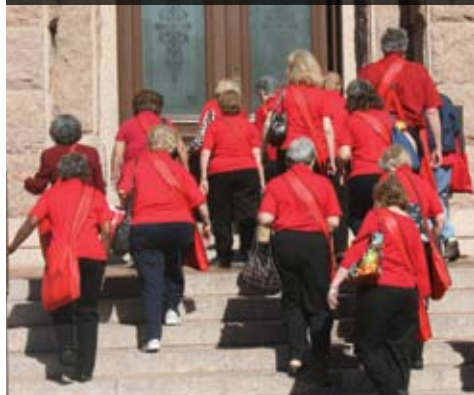
TRTA members walk up the steps to the Capitol to make their voices heard during the 2009 legislative session.

TRTA members are to be congratulated for working so fervently to benefit so many. Now, in the interim between biennial legislative sessions, it is time to educate those other retirees who have been represented by our hard work. We need them now as much as ever. The challenges are growing more difficult and the workload more intense, but with more hands to carry the load, TRTA can truly advance a legislative agenda that is beneficial to all education retirees and employees.