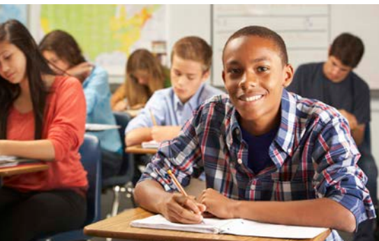
Beginning Teacher Scholarships

With your donation, we can provide financial assistance to 35+ retirees in need, award scholarships to new educators who are carrying on the Texas education legacy, award classroom grants to educators with innovative projects that motivate the students in our Texas public classrooms, and change lives while promoting a positive image of public education.