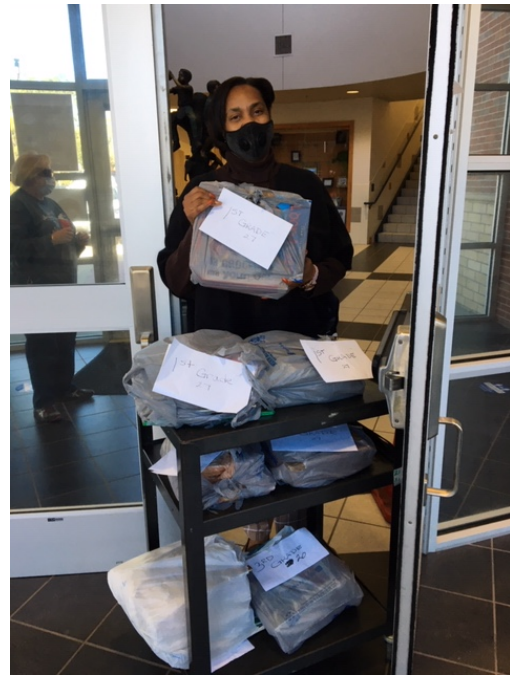
Books Delivered to Griffin

This year has been difficult because of COVID-19. Even with this obstacle, books were distributed. 100 books were distributed to the Chapel Hill Middle School ESL Department in August.