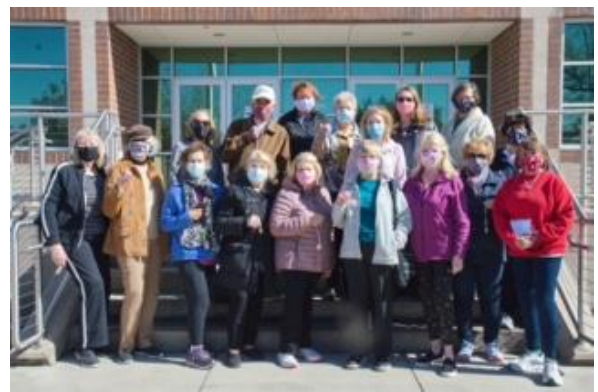
Tuesday Morning Walking Group