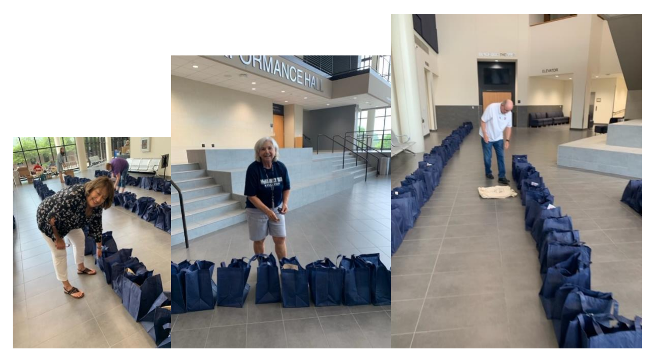
MASRA Volunteers joined in assisting the McKinney Chamber of Commerce as they hosted a breakfast for 300 new hires in