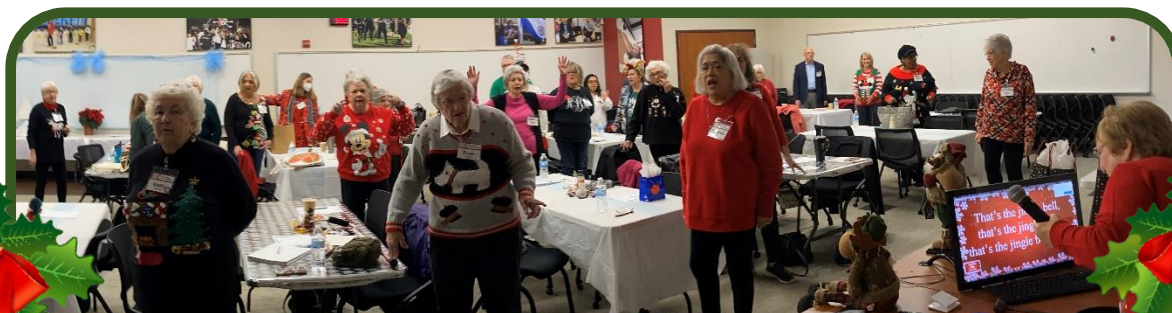
Warming Up With "Jingle Bell Rock" before the meeting!