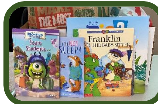
Books for ECHO