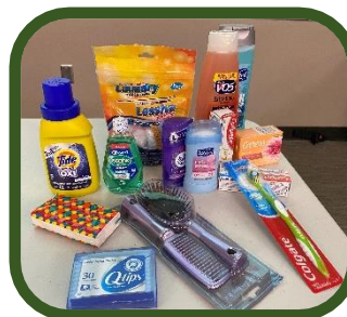
Toiletries for the WISD Program