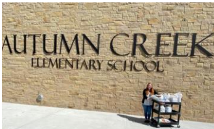
Book Donation to Interventionist Hilary Norwood