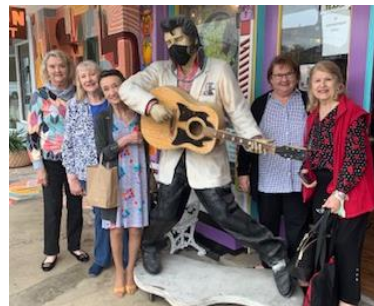
They Found Elvis!