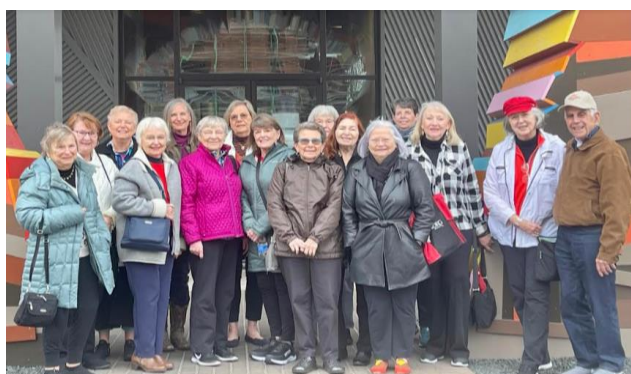
HTX Restaurant Week

Print, fill in and mail the form below to join us at our meetings and to participate in educational and fun activities!