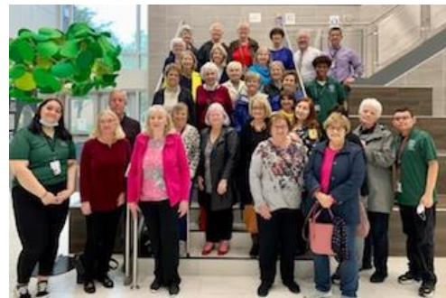
Humble ISD Tour