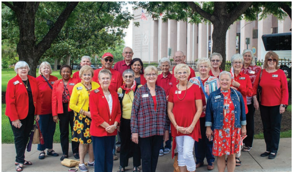
The TRTA Board of Directors and District Presidents visited the Texas Capitol in July 2021.

Protect the Texas TRS Defined Benefit Plan. Some leaders in Washington, D.C. have touted the idea that Texas public employees who are not paying into Social Security should be forced to do so. This concept is known as Mandatory Social Security. While there may be some advantages to having all Texas public workers pay into the federal Social Security program, the strategy to implement the concept often leaves our state defined benefit retirement systems without the assurance that it will be protected and remain fully funded.